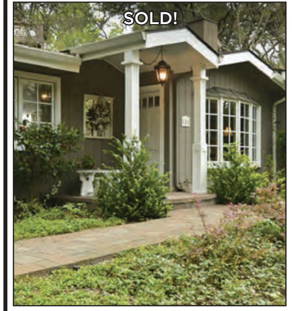
1 North Lane, Orinda SOLD! $930,000